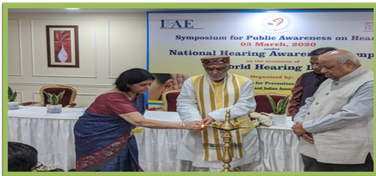
Honourable Chief Guests during Lamp Lighting session