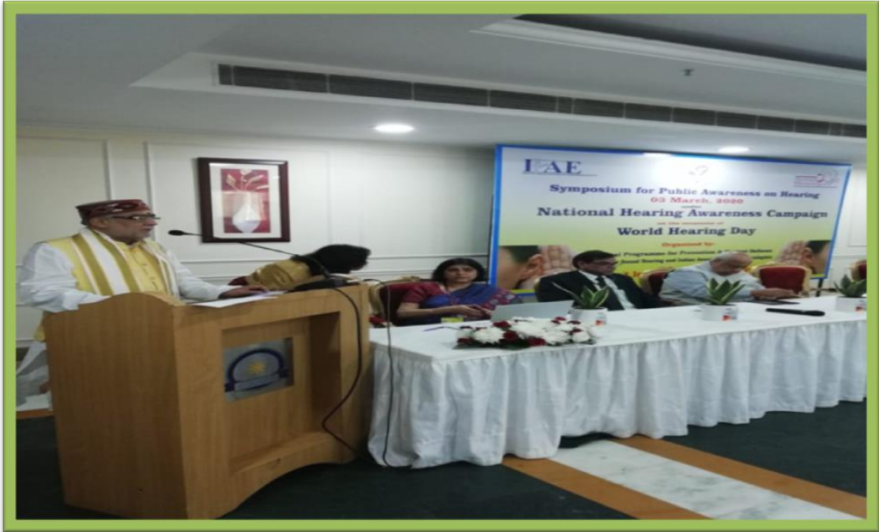
Honourable Minister of State Shri Ashwini Kumar Choubeyji addressing the audience