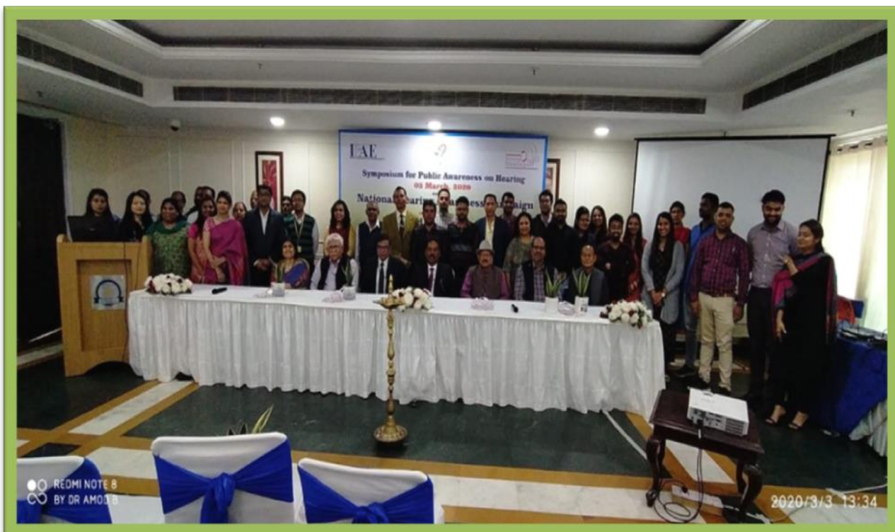
Group photo on the occasion of World Hearing Day