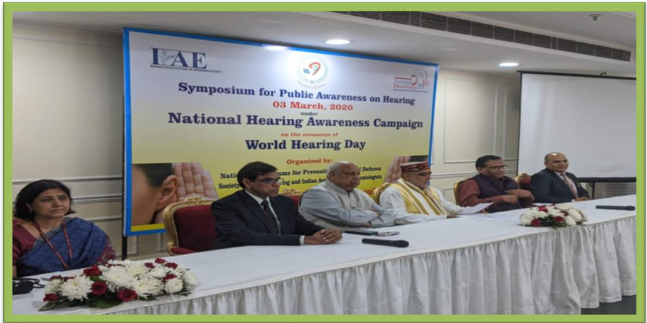
Distinguished guests during the welcome session