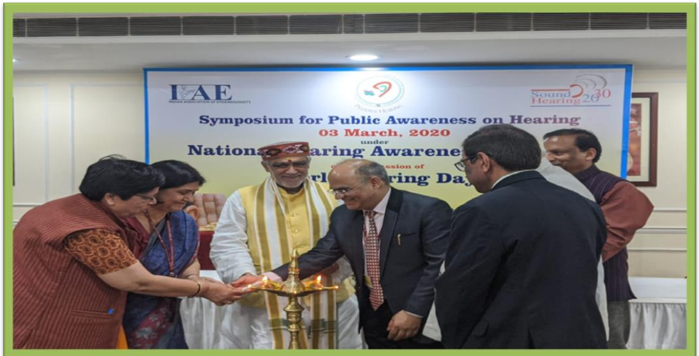
Lamp Lighting session